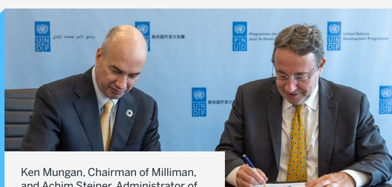
and Achim Steiner, Administrator of UNDP, sign the agreement on GAIN.

There were only 35 known actuaries working in Egypt, a country of 110 million people.