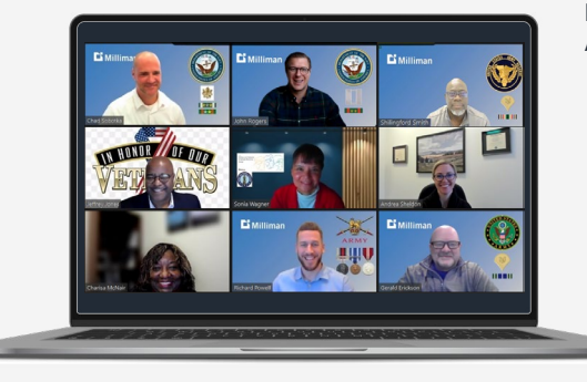
The Military and Veterans Employee Resource Group held a virtual firmwide meeting in 2022 to celebrate Veterans Day.

We empower and encourage our people to contribute more and varied ideas. Through their contributions, we embrace the diversity of cultures, views, religions, languages, and experiences across our global firm that help us better serve our clients worldwide.